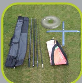
Drive-on car foot