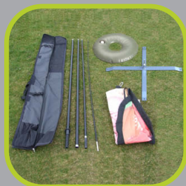
Drive-on car foot