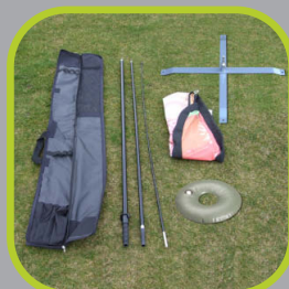
Drive-on car foot